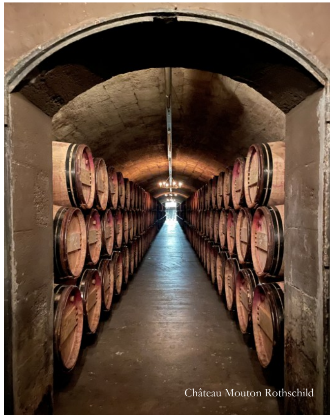
Château Mouton Rothschild

Mouton's free-draining, deep, gravel soils once again proved key in this hot, dry year. 2025 was the earliest harvest ever from 5 th to 20 th September and the grand vin includes a historically high proportion of cabernet sauvignon in the blend. Technical director, Jean-Emmanuel Danjoy, shortened the cuvaison to extract only the finest tannins and the wine will be aged, as usual, in 100% new French oak barrels for 18 months. This is the fleshiest and most generous of the first growths with ripe blackcurrant and sweet spices on the nose, a rich, sumptuous texture and powerful but supple tannins that will ensure it ages magnificently. 99 points. Drink 2038-2055.