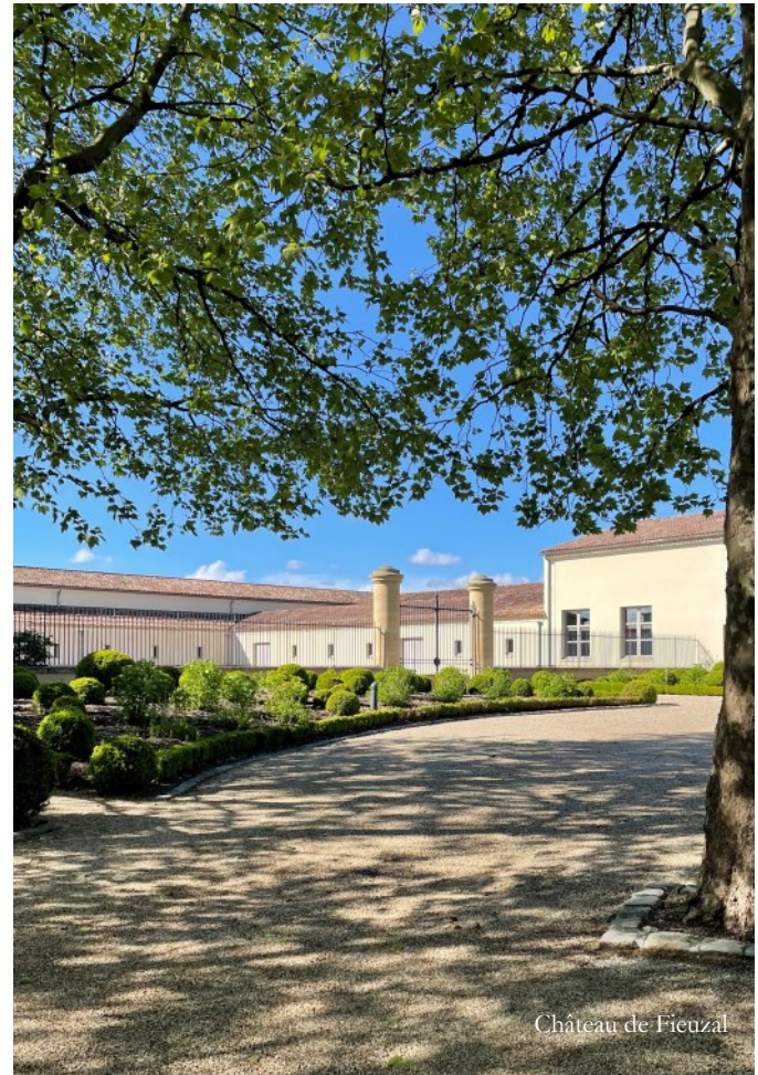
Château de Fieuzal