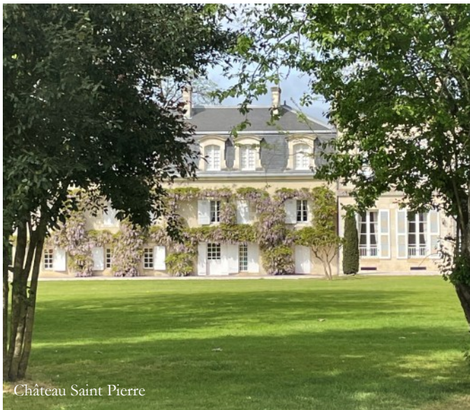
Château Saint Pierre